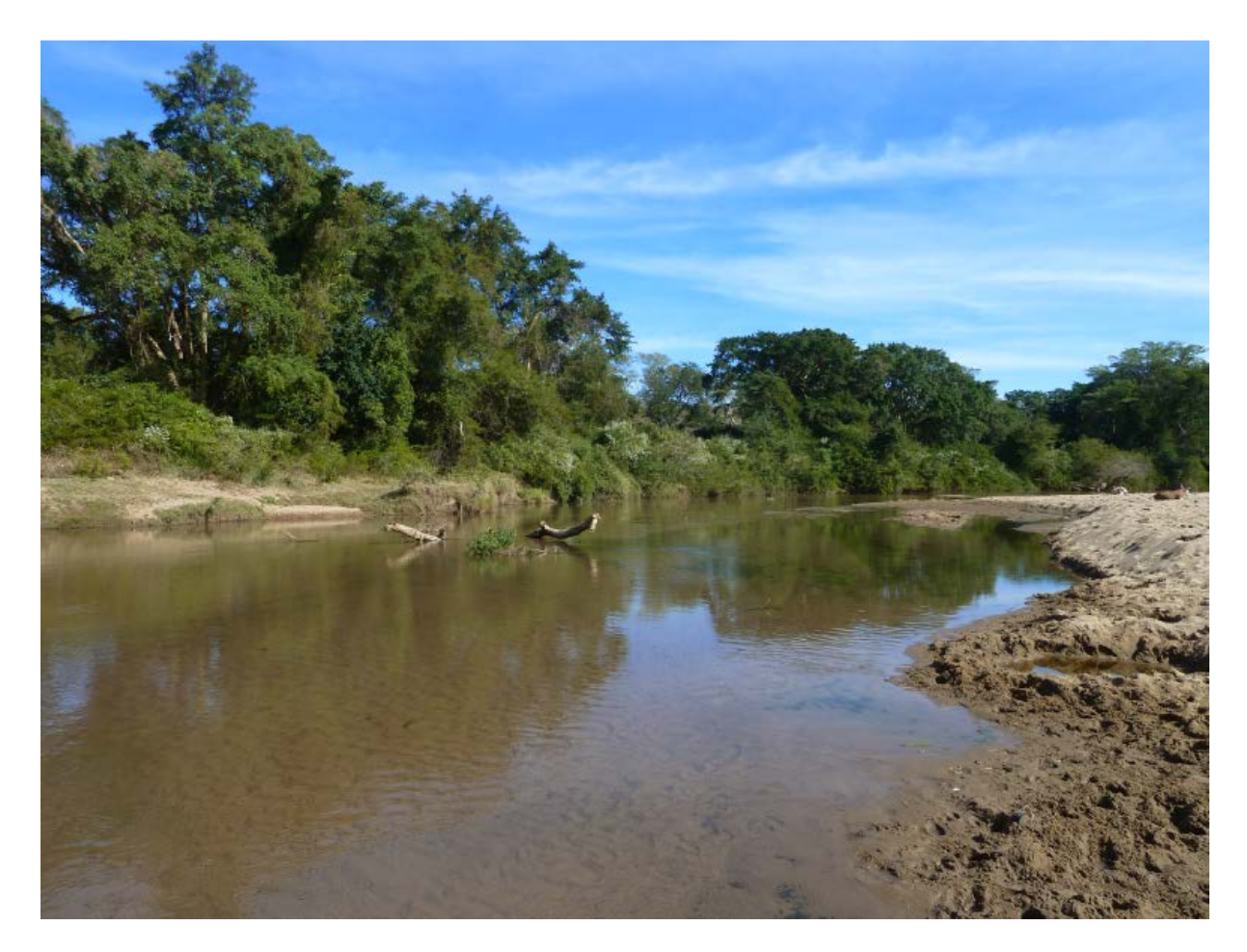
Figure 8-1 Riparian vegetation on the Mkuze River (vegetation Ecospecs for the Mkuze River are provided in Section 8.1.3)

The vegetation Ecospecs are intended to provide narrative, and where possible quantifiable and enforceable, descriptors of the riparian vegetation for the recommended ecological category (REC) for each of the study rivers. In each of the tables below (Section 8.1.1 to 8.1.8), predicted change as % of Baseline refers to the change expected for the Ecological Reserve to maintain REC.